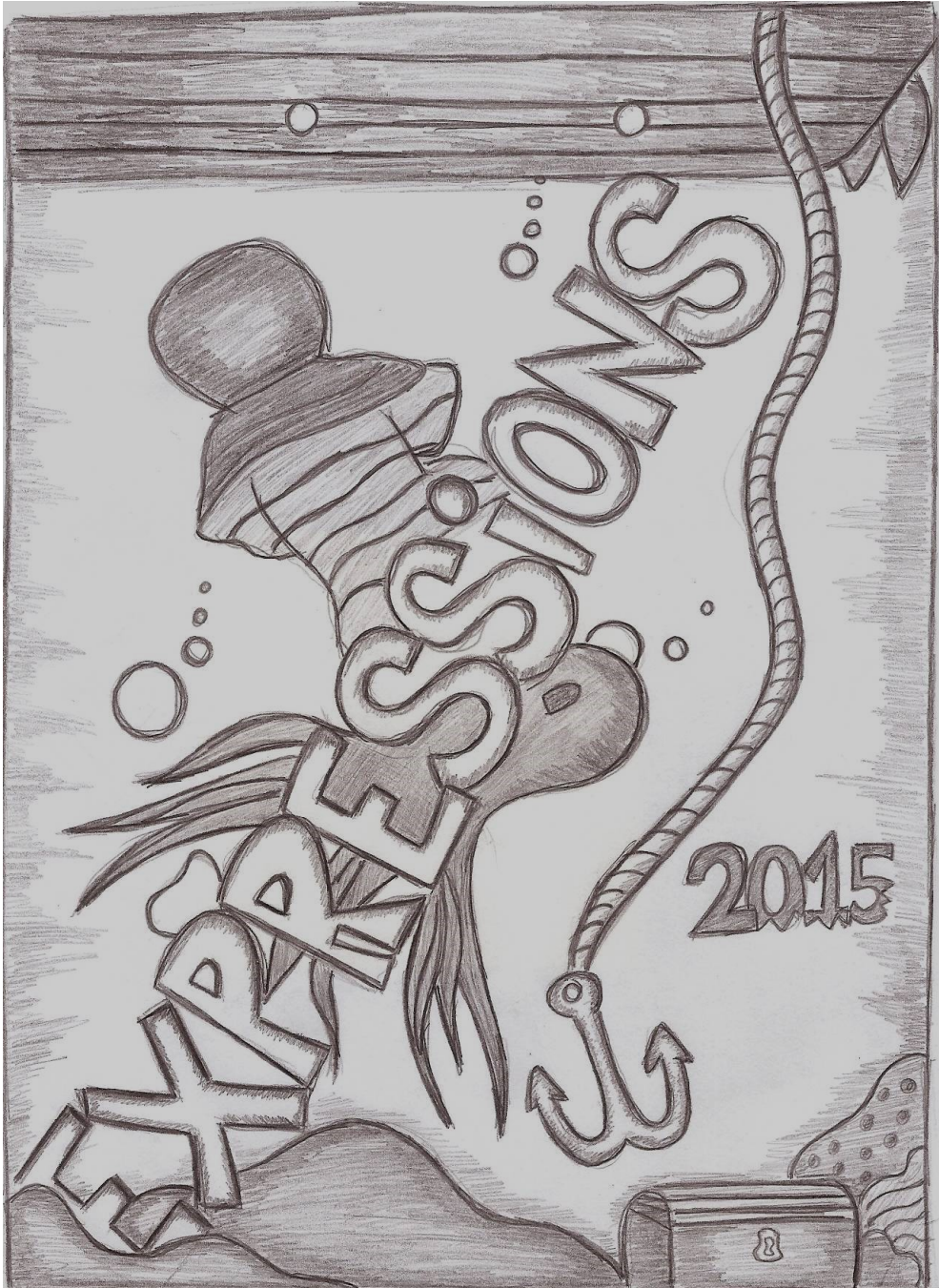
Cover Art-Third Place