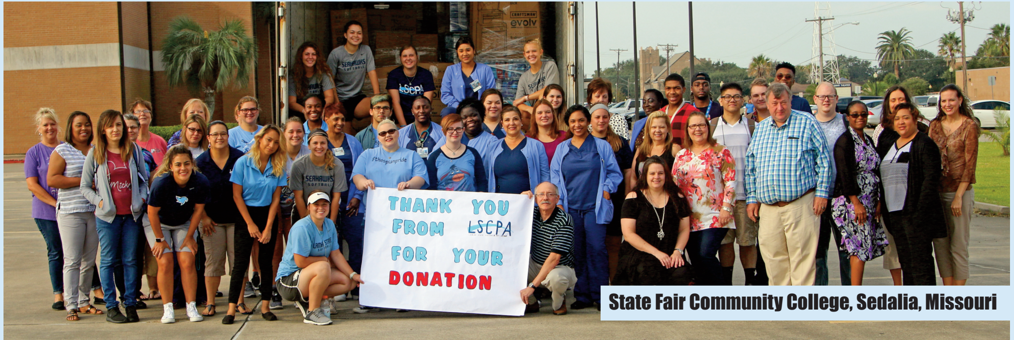
State Fair Community College, Sedalia, Missouri