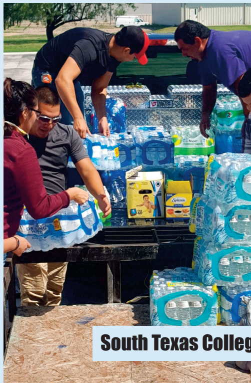
South Texas College, McAllen, Texas